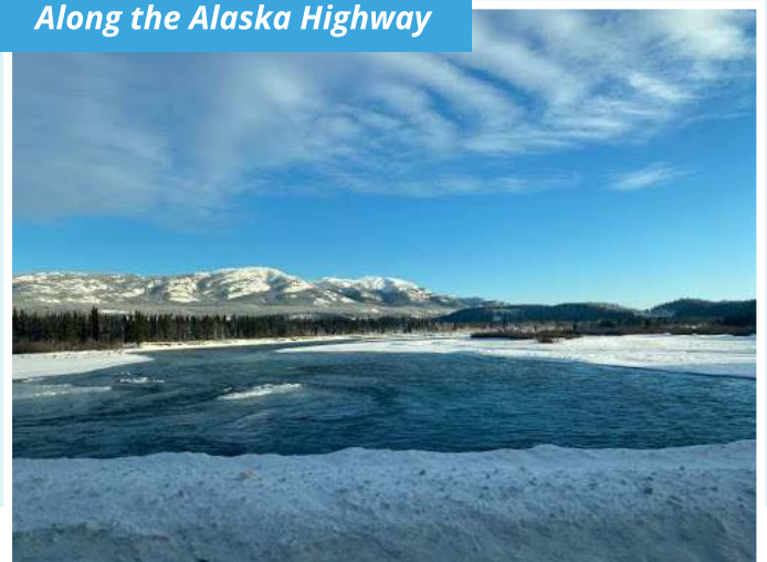
Along the Alaska Highway