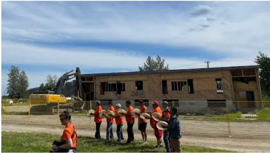
A scene from the ceremonial demolition on Wednesday at the Lower Post residential school. The rest of the structure will be burned when it is safe to do so.

CBC News · Posted: Jun 30, 2021 2:00 AM CT | Last Updated: July 1