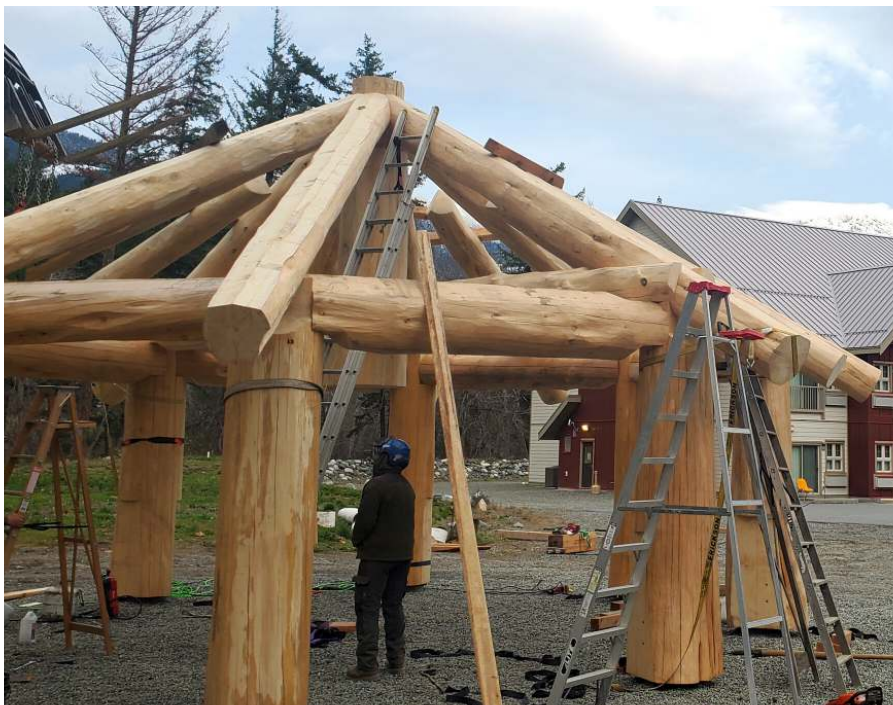
The Gazebo will promote St'at'imc culture to visitors at the Lil'tem Mountain Hotel (pictured in the background)

Our team was able to support Tsal'alh in successfully securing funding to construct a community gazebo. Made out of Yellow cedar, it will be a multi-purpose space that the community can use for gatherings. And as you can see in the picture below, the gazebo is only a few steps away from the Lil'tem Mountain Hotel, providing a beautiful gathering spot for members and visitors alike.