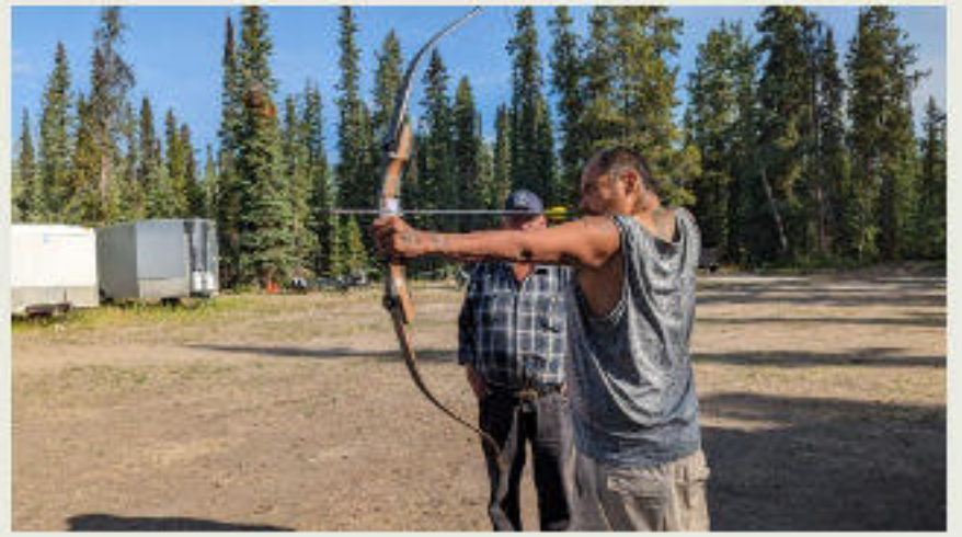
Archery using handcrafted arrows.