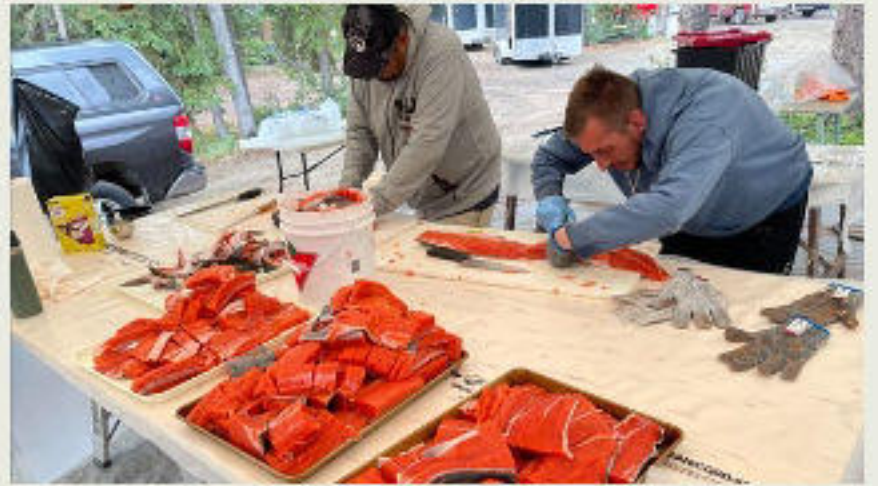
Skinning and smoking salmon.