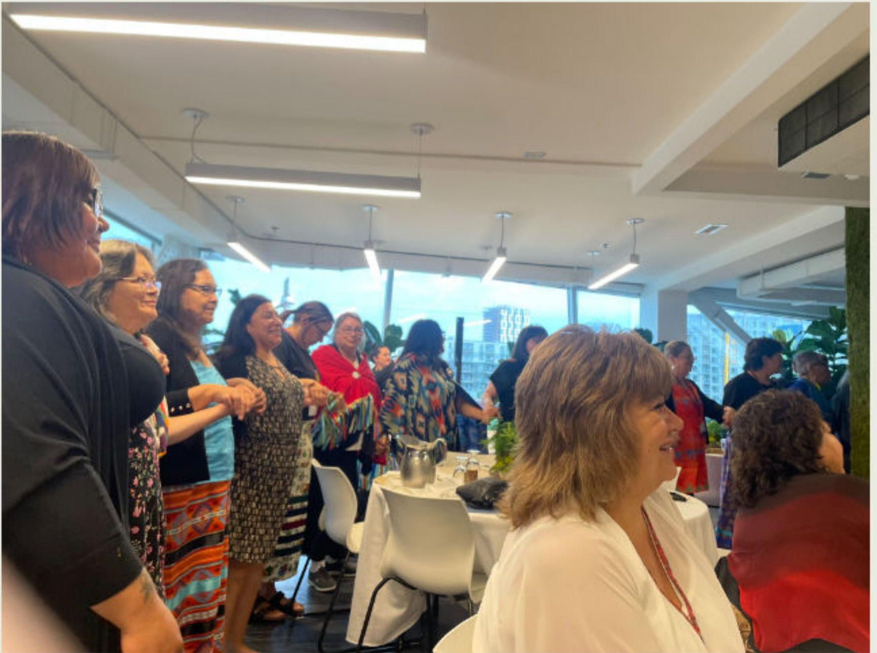
AGM attendees from across Canada joining hands for a round dance to celebrate togetherness and remembrance.